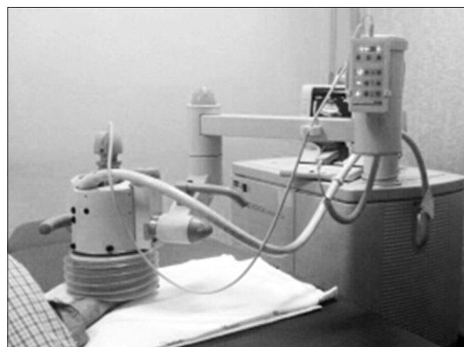
Fig. 2. Extracorporeal shock wave therapy device.

Patients were seated on a moveable chair and the affected trapeziometacarpal joint was positioned on the treatment head with the forearm supinated to allow for perpendicular application of shock waves with ultrasound guidance on the whole joint from the dorsal to the volar aspects. Ultrasound gel was used as a conductive